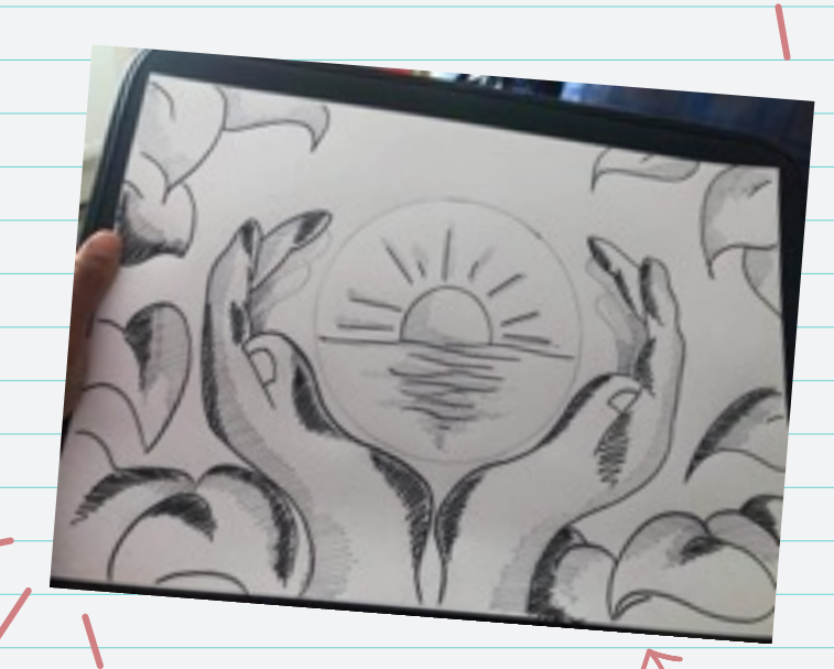
Children and young people drew designs for our garden wall, and artists from Blackfest combined the design into this wonderful mural, depicting parts of our diverse community in Wirral.